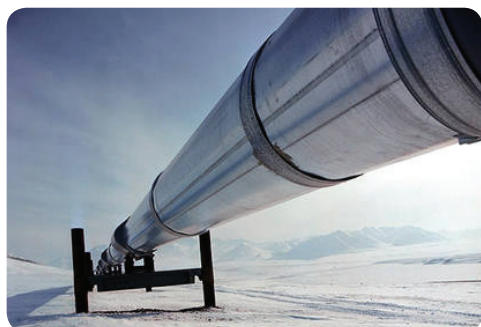
Low Temperature Capability comparison